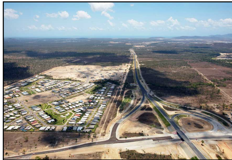
Townsville Ring Road, Herveys Range Rd to Shaw Rd section, Source: DMR

Deeragun appeals to families and young couples seeking an affordable entry into the residential market. This is supported by ABS census data which reveals that 46% of Deeragun households are couples with kids and 33% of households are couples without kids. Furthermore, the average age is young at 30 years. The estimated resident population of Deeragun was 2,939 persons as at June 2007. The population growth rate was a very strong 5.4% between 2006 and 2007, well above the Townsville figure of 2.7%.